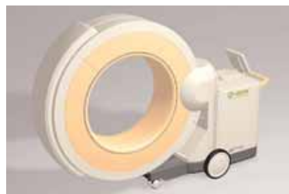
The O-arm allows for an immediate, accurate view of patient anatomy and instrument placement.