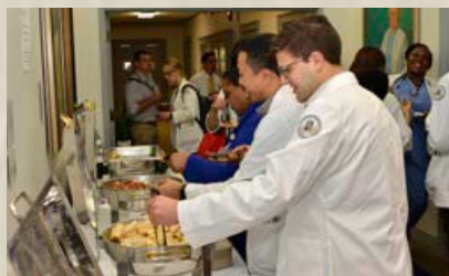
Reception following the ceremony with family and friends