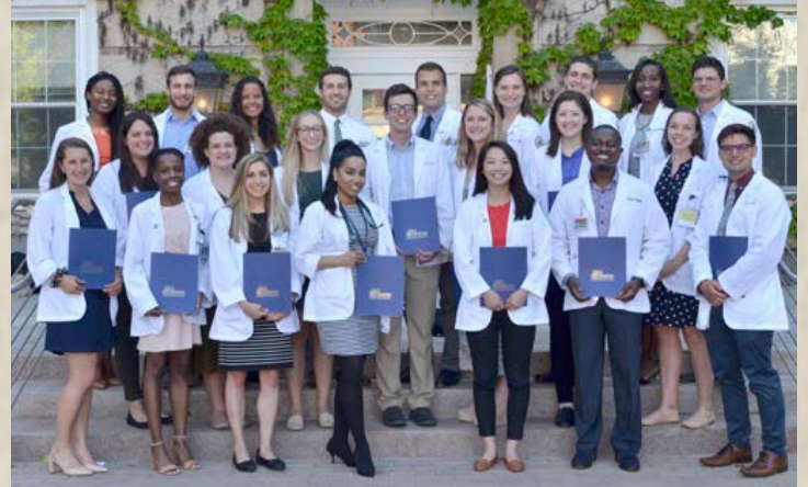
Class of 2020 Student Recipients