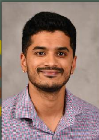
Dr. Akshay Venkatesh