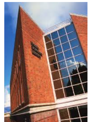
Health Sciences Library