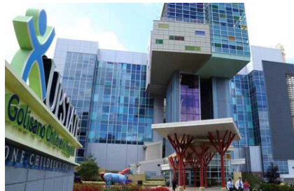
Golisano Children's Hospital