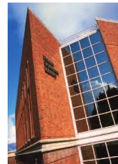
Health Sciences Library