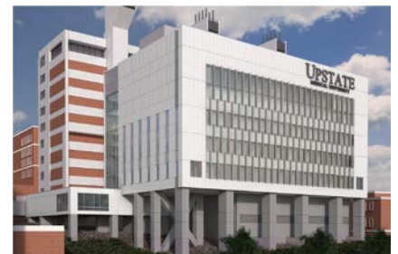
The New Academic Building

University Police Department • 750 East Adams Street Syracuse, NY 13210 • Phone: 315-464-4134 • Fax: 315-464-4140