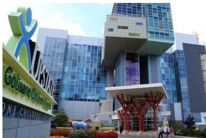
Golisano Children's Hospital