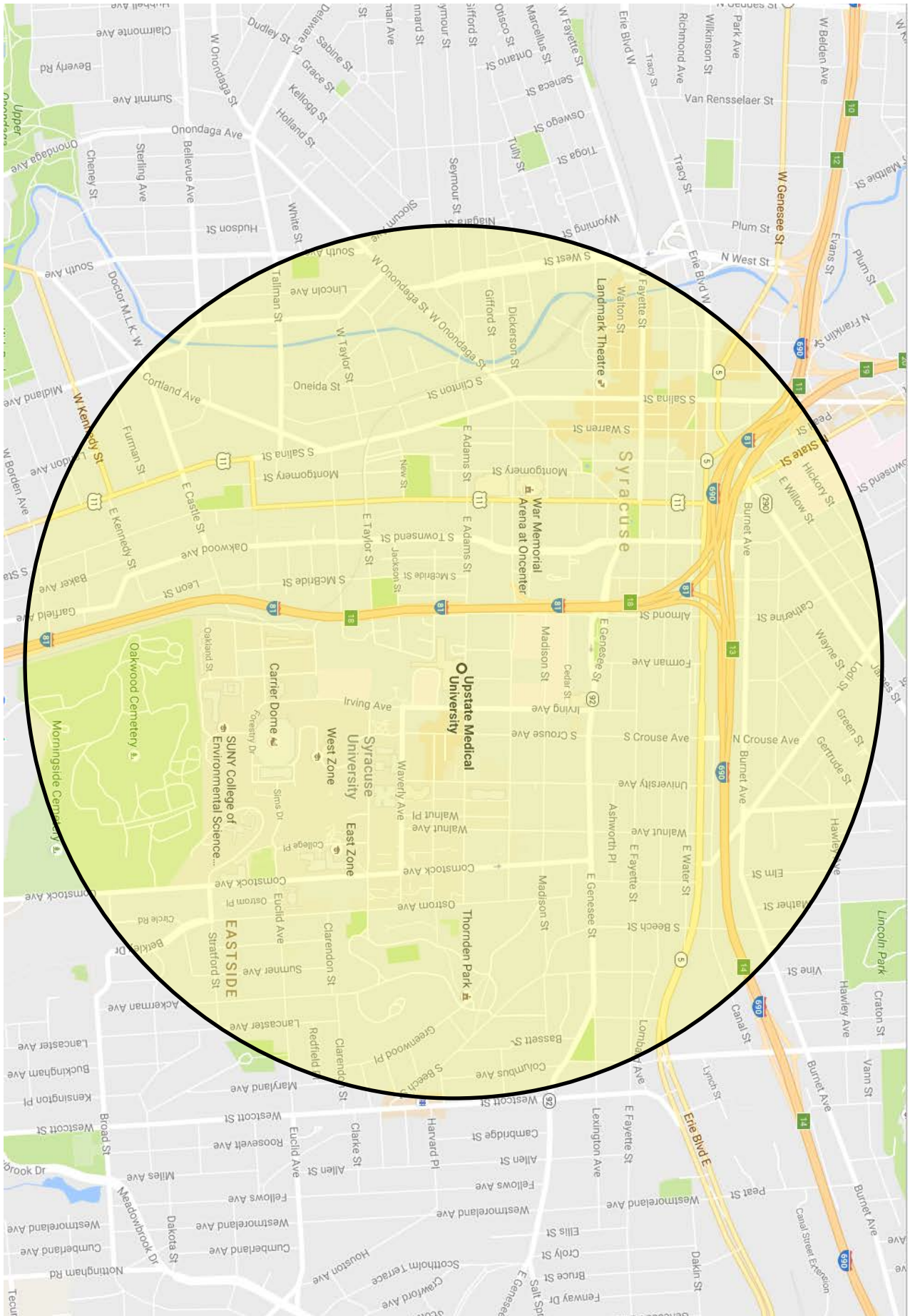
This map illustrates a one (1) mile radius around Upstate University Hospital