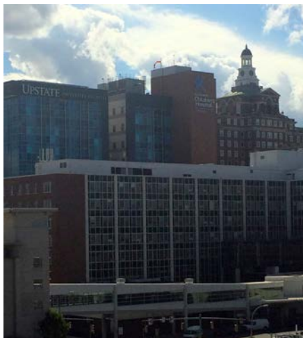
Upstate Medical University