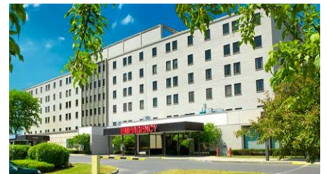
Upstate at Community