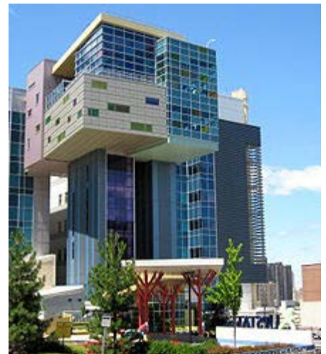
Golisano Children's Hospital