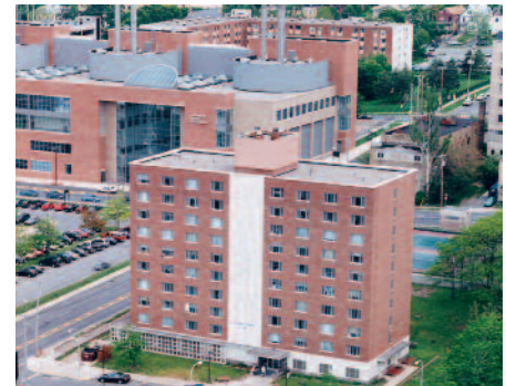
Institute for Human Performance and Clark Tower Residence Hall