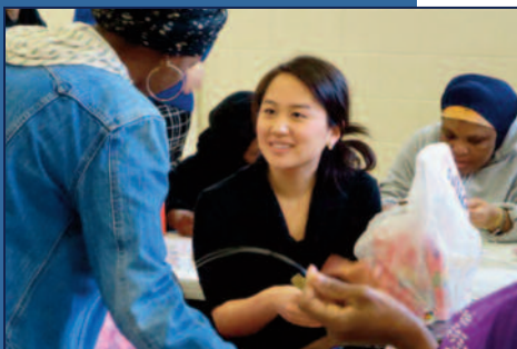
A program for Somali refugees in Syracuse