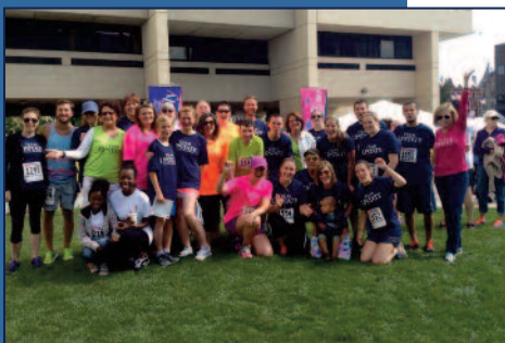
Paige's Butterfly Run - a Foundation program that supports kids with cancer