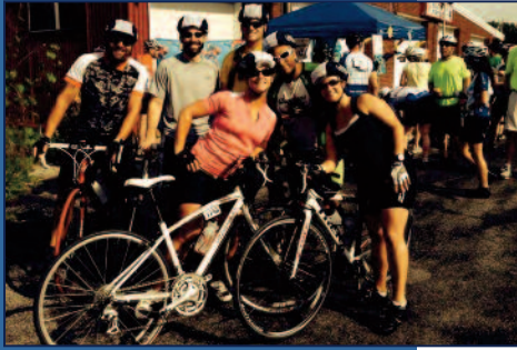
Tour de Cure