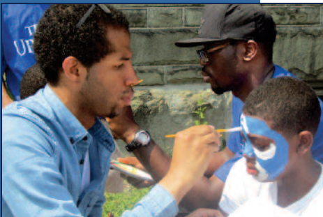
Youth Day BBQ/ Backpack and School Supply