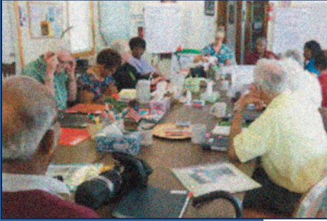
Chronic Disease Self-management education