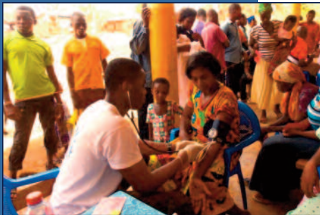
Medical mission in Ghana