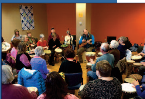
OASIS offers many programs for seniors

HealthLink also held seven chronic disease classes with 92 attendees. This is an ongoing collaborative with the Office of Aging and Long-term Care). OASIS also offers free space for four programs.