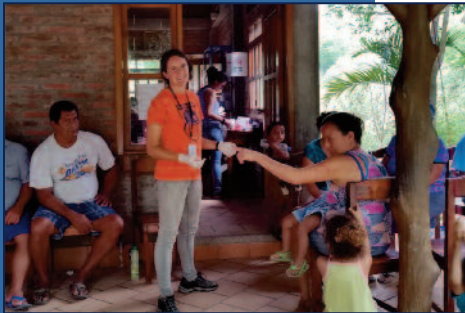
Student providing medical care in Ecuador