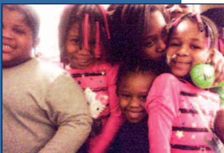
Story time at Pioneer Homes