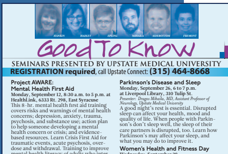
Healthlink's free seminars

Is an award-winning, 60-minute talk show that explores a variety of health and medical issues, and showcases Upstate faculty and staff and other experts with ties to Syracuse and Central New York. The program has been produced since 2006 by journalists in Upstate Medical University's marketing and university communications department. This form of health education is broadcast twice each Sunday via NPR station WRVO and reaches listeners in Cortland, Geneva, Hamilton, Norwich, Oswego, Syracuse, Utica, Ithaca, Fenner, Rome, Clayton and Watertown. It is also available on demand by podcast, live online, and to a growing listenership via iTunes. Its programs remain archived on the show's website.