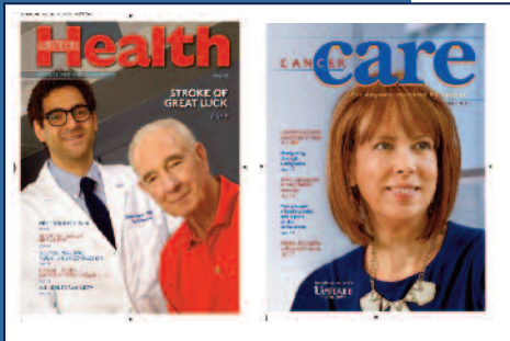
Upstate magazines offer free health information and education

Trained mentors, currently eight Upstate Medical students , volunteer one hour a week on Wednesday afternoons at Bellevue Elementary School in Syracuse, engaging with 3rd and 4th grade students in one to one activities. Both the children and mentors have found this to be beneficial and each look forward to their weekly encounters.