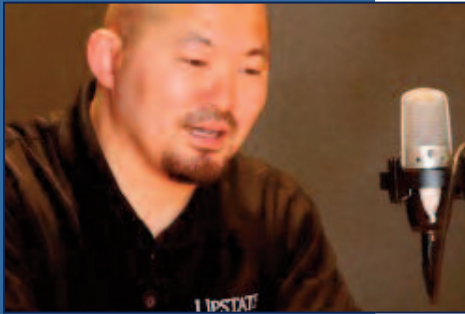
Upstate physician gives radio interview on traumatic injury