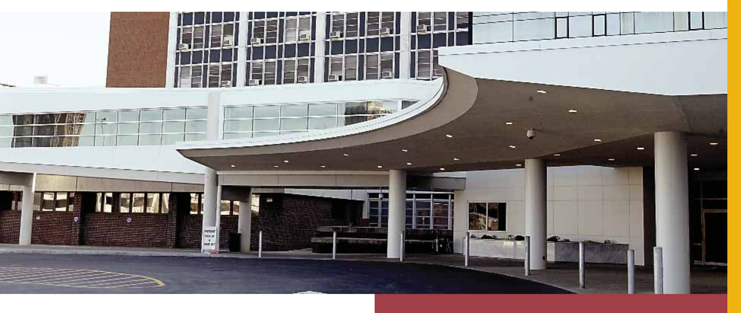
University Hospital, Syracuse, NY

Among its many functions, the Commission on Cancer sets standards of quality for patient care and surveys facilities to evaluate compliance with 36 standards set by the commission.