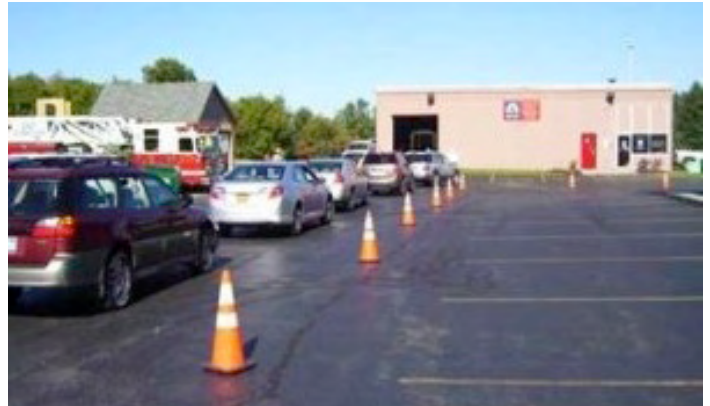
Cars line up at the Cortlandville fire station to drop off unused medications

Over 200 cars drove through for the recent medication collection event in Cortland County that allows people to safely dispose of medication they are no longer using. Since the program was introduced five years ago, community members have safely disposed of 10,803 pounds of unused, expired and unwanted over-the-counter and prescription medications free of charge, safely and securely.