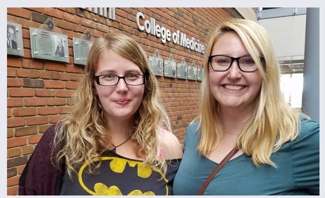
Last month, we welcomed 19 first year students into the College of Graduate Studies at the annual Welcome Reception. Current students, postdocs, faculty, and staff attended.