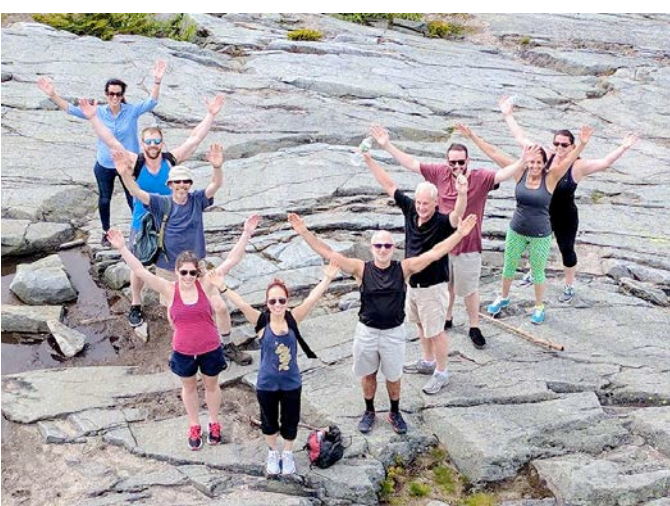
V-ATPase people making a V during the annual hike up Mount Kearsarge